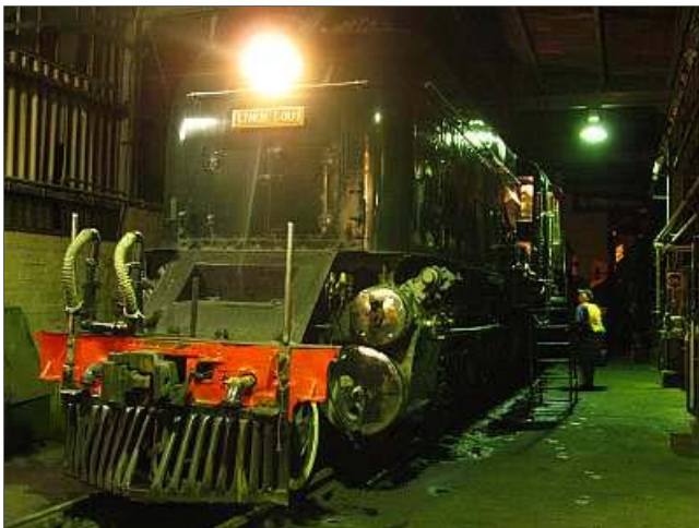
S16 - The shank end of an all night shift in getting the engine ready for the first run under the Steam in Action banner. The repair boys are just finishing up and the train's coaching staff have already arrived.

GMAM No.4079 "Lyndie Lou" was steamed again on 30 May 2008. It was an inauspicious start as we essentially used a paying run as a test trip.