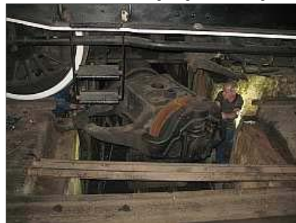
S05 - Using original railway equipment and a wheel drop pit, the original Bissel truck is removed. We got plenty of exercise!