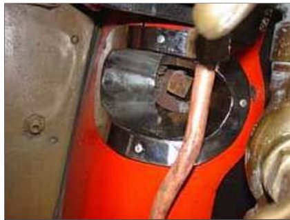
R02 - Attention to detail. Lyndie Lou's washout plug pocket liners were carefully crafted by a professional copper smith.