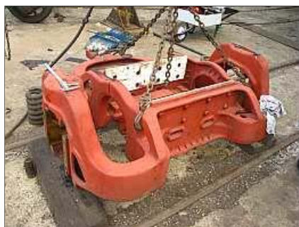
S08 - The stripped, cleaned and primed Bissel truck frame clearly shows the use of maintenance-free Vesconite as a modern bearing material for the bolster plate slides.