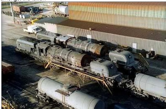
G01 - The last fling for about a dozen Garratts - the locomotive yard at Randfontein Estates. This is where the GMAM No.4079 "Lyndie Lou" spent 11 years toiling amongst the mine dumps. Pictured are REGM "R9 Kathy" (Rear) and REGM "R12 - Vivienne". (Ex SAR No.4136 - Now in store at Bloemfontein.)

During the seventies and eighties, many ex-SAR steam locomotives were sold into private service and were fortunate enough to remain active while other went to the "strategic reserves" or straight to the dead lines. Some of the industrial machines were operated on a thrash-and-replace policy while others were relatively well looked after and ended up working for a decade or more in their second lives. Ex-SAR No.4079 was fortunate enough to be amongst the latter.