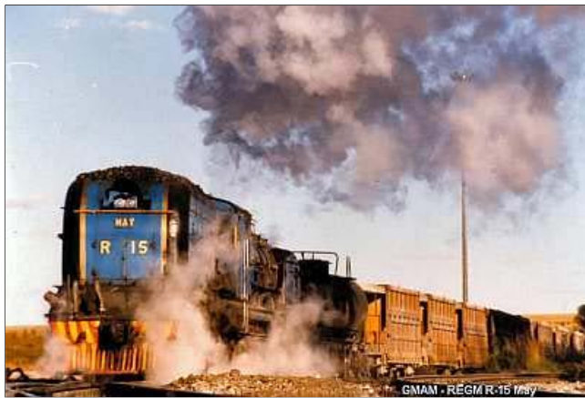
G02 - Ex-4079 as she looked when just starting her gold mining work - the paint still gleaming and the cow catcher is still straight! Notice that the trim lines were gold instead of the cheaper, later yellow. She wouldn't look this good again for another 15 years!

The brace of articulated machines kept company with a solitary, ancient Class 1, and several ex-SAR Class 15BR's. Garratts and gold are a good combination - the articulated GMAM engines performing well on the lightly laid track of the Cooke shafts, the modern features of the engines easing the maintenance costs. Their thirst for water was easily met on the relatively short runs, and the straight-through depot design was convenient for the use of auxiliary water tankers.