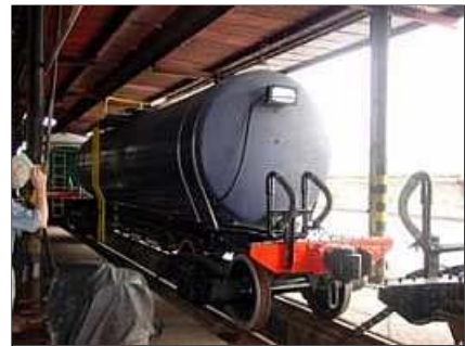
R03 - Lyndie Lou's water canteen has just been cleaned and all auxiliaries and fittings repainted. Note the fitted double-beam headlamp for operation in reverse.