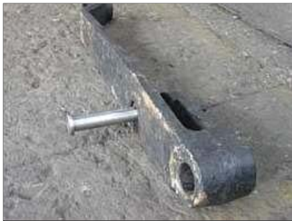
R01 - One of Lyndie Lou's brake hangers being refurbished. All the hinge and locating pins were made in house and the metal specifically hardened for service.