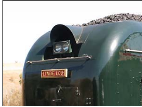
i01 - The name board that says it all, mounted on a gleaming green machine, bunker well topped up with coal, reflecting the country scenery - (Articulated) Steam in Action in 2008.