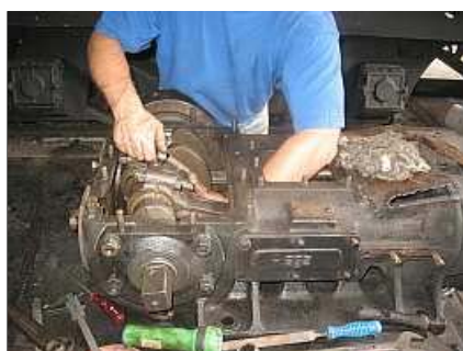
S11 - An experienced ex-Millsite Railways fitter is up to the elbows in a full rebuild of Lyndie Lou's stoker engine.