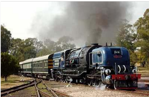
V01 - In 2006, a recently outshopped and newly certified Lyndie Lou on one of her first Rovos Rail runs.

In 2005, the idle GMAM Garratt "Lyndie Lou" was leased to Rovos Rail to put her back to work and thus added a fourth notch to her service record. From SAR+H freights, through to gold mine service, and sporadic preservationist's specials, this mighty engine proudly took the luxury long-distance Rovos Rail trains on Transprovincial and International tours. These tours were not operated from a steam preservationist's perspective, but from an attempt to recreate the good life from colonial times.