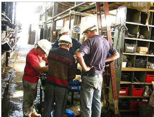
S17 - Four men and a Stoker. The patient can hardly be seen amongst the surgeons.

Reefsteamers retains a classic railways style faults reporting system - The Locomotive Repair Journal. Each one of our locomotives, including those placed under our care by Steam in Action, has its own Repairs Journal where faults and deficiencies discovered on trips are immediately recorded by the duty crews. Thus, we have a permanent record of what faults developed, when they were noted, what needs fixing and who did the work. Nothing gets overlooked, even if the last footplate crew aren't on duty.