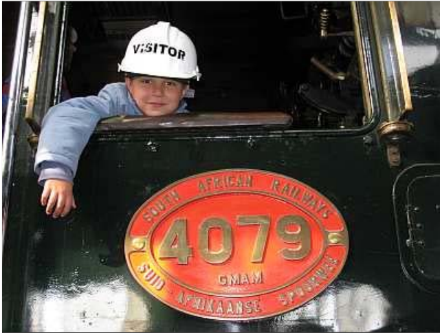
S18 - This young lad symbolizes what steam preservation is all about. Enjoying these amazing machines today and preserving them as living history, their stories to be read for future generations to come.

This magnificent machine stands on 28 wheels in a 4-8-2 + 2-8-4 arrangement (A "Double Mountain"), 28 white rimmed wheels in all. However, she stands equally on the original foresight and passion of Wilfred E. Mole and of the Sandstone Heritage Trust, as well as the present dedication and labour of love of the Reefsteamers, who are proud to have been elected to be the caretakers of the machine, and committed to her charge. It is hoped that she has found her final home and final duty.