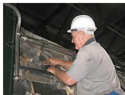
S12 - An old railway man faces the tedious task of removing the paint from the brass and copper work.

The entire stoker engine had to be rebuilt by hand, carefully matching parts from the original, parts from spare units and the parts bins, and some newly fabricated. The original crankshaft was used but bearings sourced from our stock of spare stokers. Even so, new shims had to cut and fitted for the connecting rod big-ends to mount the bearings properly. The valve eccentric sheath straps were scraped to suit. New piston rings were sourced and the slots custom cut to fit the bores. A full set of 6 valve rings were turned and slotted from scratch, while new ball bearings and seals were purchased and fitted for the crankshaft. The overhauled stoker was bench tested, pronounced successful and then installed on 10 May 2007.