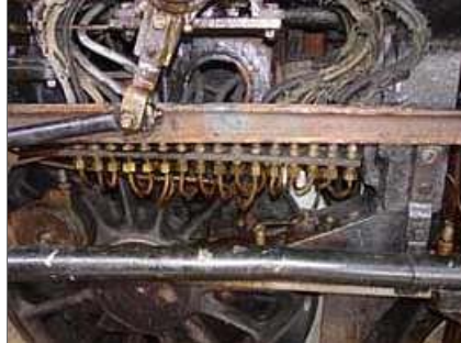
R05 - The intimidating array of fine bore copper pipes and brass unions of the complicated mechanical lubrication system which was stripped, cleaned and serviced. The actuating crank is visible at top left. The black pipe across the bottom is the train-brake vacuum line.