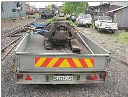
S04 - The donor Bissel Truck as delivered on a heavy duty trailer in which the wheel flanges left two deep dents in the load bed and pressed the nose wheel deeply into the ground.

The spare Bissel frame arrived on a rather dull, chilly Saturday, 6 October 2007 upon which Wilfred Mole himself had come to a Reefsteamers Club meeting to introduce himself to our members (Many of whom are fairly new) and to officially inaugurate Steam in Action. It was appropriate to do our first depot based SIA work right after the meeting, and a sociable braai (BBQ) in the Workshop, by unloading the spare Bissel from the tandem axle trailer in which it arrived. Removal of the Bissel truck under the leading engine unit began the following week.