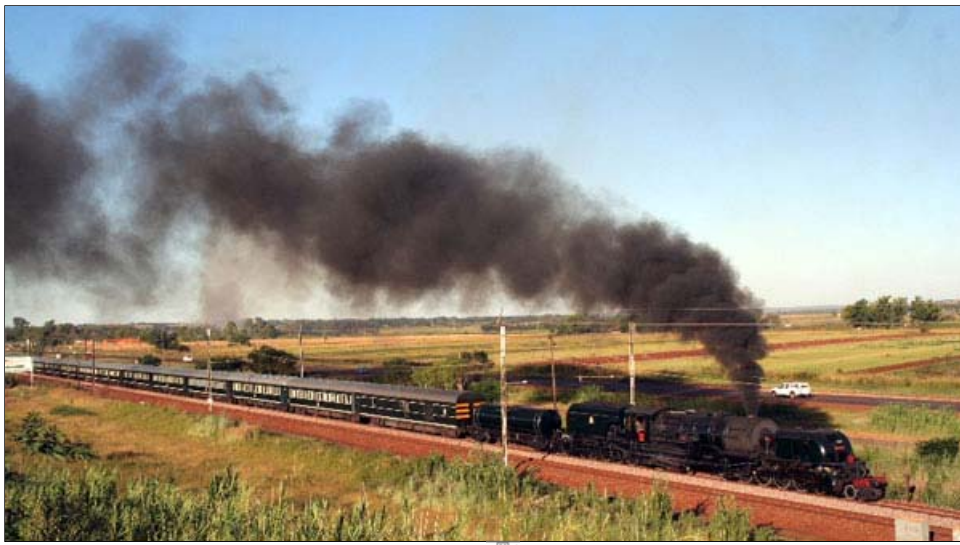
S01 - Some hard work for a grand old lady 🚂 Lyndie Lou spent a brief period as the flagship for Rovos Rail, pulling beautifully appointed but very heavy luxury trains.