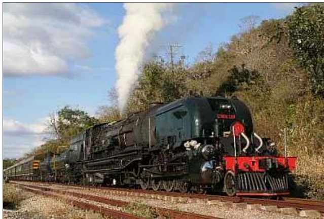
R07 - A newly repainted Lyndie Lou during a strenuous debut run in the eastern Transvaal. Note the CLEAN stack and the blowing safety valves.

The most obvious external Capital Park Rovos-era change was that the locomotive and the tank were later re painted in a smart dignified Brunswick green, without lining, to match the livery of the Rovos Rail coaching fleet. The wheels and the center frame flanges were lined in white and the cylinder + valve covers remained chrome plated. This is the appearance that the engine retains at the time of writing. (June 2008.)