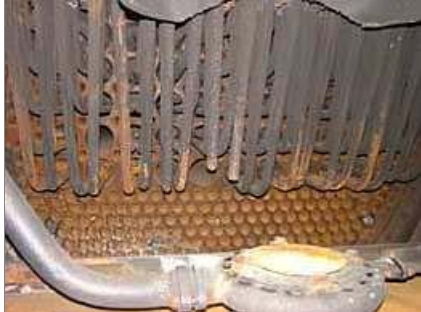
R04 - With the smokebox spark arrestors removed, the super heater elements are clearly visible as the vertical pipes turn (in pairs) into the wide bore flues. The two empty flues show where the two faulty elements were removed. That "gas-burner" object in the foreground is the actually the blower ring.