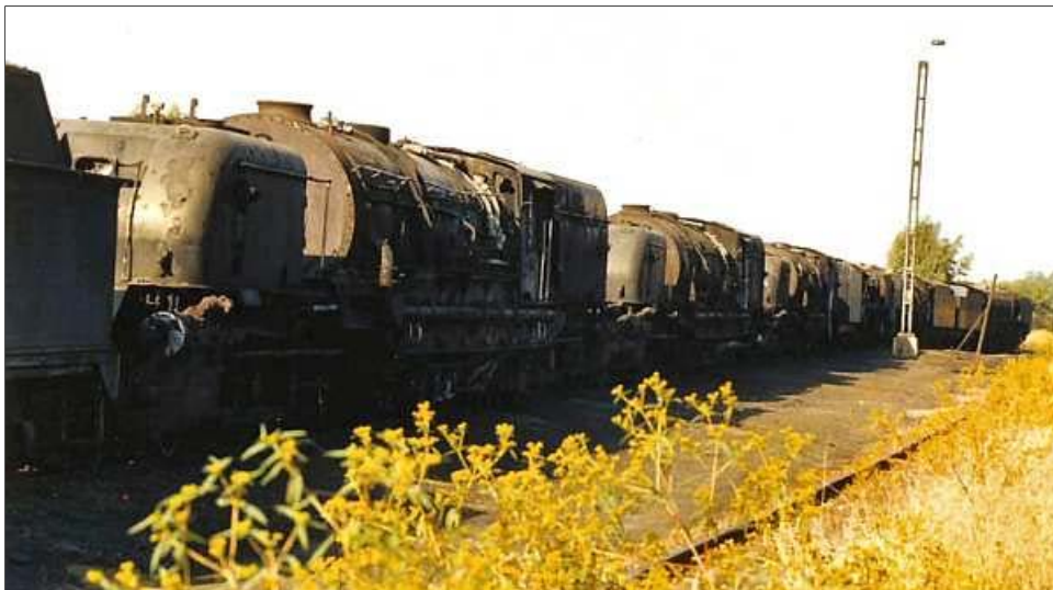
i04 With their stories coming to a sad end, a row of dumped GMAM Garratts slumber in the deadlines at Capital Park, Pretoria. (Pic by Dennis Summergil March 1983)

But if you look around amongst the cold crusty iron, the glassless cab, the fossilized grease in the under carriage, you'll find evidence of the engine's former life. Perhaps a smiley face sticker, or a forgotten tool, dusty chunks of coal lying amongst the remains of the grates, or still-cheerful glitter embedded in one of the remaining turret valves, or a custom fitted rubberized grip on the reverser handle. A tail marker might still be present, or perhaps a modified pipe in the stoker alcove, a bent lamp sanction or a reverser's actuating and indicator rods painted in contrasting colours the fading reminders that this machine was once operated and cared for. Look for the clues, learn about the engine class, and you might be able to hear the lingering whispers of the engine's story.