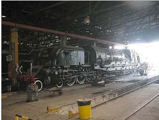
S03 - Lyndie Lou at rest in the Reefsteamers workshop for some Bissel Truck work and a Stoker Engine overhaul. This massive engine sure takes up a lot of space!