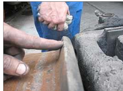
S06 - I'm pointing at the severely worn and pointed wheel flange that alerted Mole's inspection team to impending issues with this engine.

When the Bissel Truck had been removed and dismantled, the problem was immediately found. Due to lack of lubrication (Including missing oil lines), the bolster plates had seized, which prevented the Bissel Trucks from completely centralizing after curves. This had put much lateral stress on the axle bearings and had worn out the wheel flanges. The good news was that the frame of the Bissel Truck was not twisted after all, but the bad news was that the Bissel Truck under the trailing engine unit was in a similar condition, although the flange wear wasn't as bad.