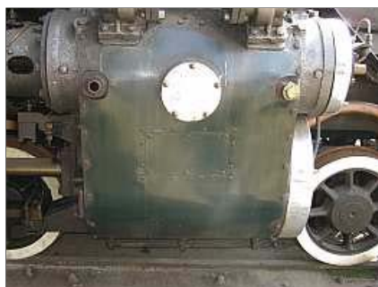
S14 - A little hole, just a little valve chamber plug - but what a lot of work to get them to screw in safely. Hammers, dripts, scaffolds, taps, chisels, some large spanners and a lot of acetylene!