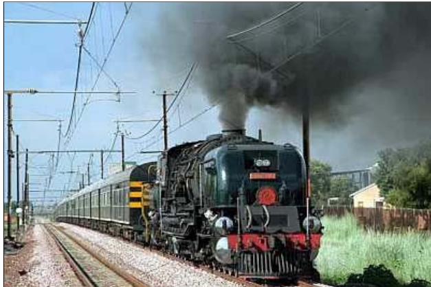
V02 - Six months later, the now green painted engine in full service, proudly carrying the Rovos Rail headboard, storms south near Bon Accord with 18 coaches. (5 February 2007)