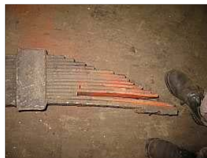
S15 - One axle spring with a broken leaf that fell completely out upon removal. And even in the small photograph, you can clearly see a second broken leaf two leaves up from the gap.

The following people were involved in getting Lyndie Lou into shape for SIA service : (In alphabetical order)