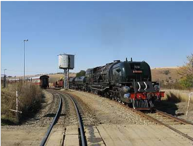
i02 - A brand new tale that no one has ever told. Backing around the day-tripper train on her debut run in SIA service - this locomotive has come a long way from drag and industrial service.