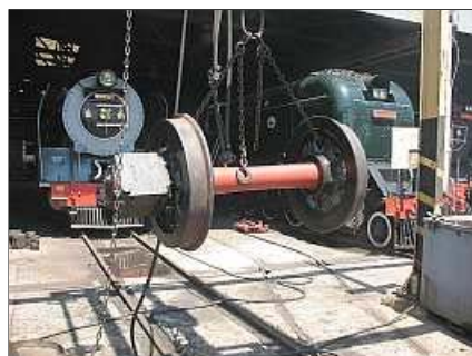
S07 - The overhauled donor Bissel axle with a full set of new bearings is being hoisted to the work area with Lyndie Lou's coal bunker poking out into the sun at the rear right.

steam locomotives in South Africa. (Our 15CA and one of our 15F's runs completely kitted out with Vesconite in the valve motion and no discernable wear has been found after 8 years. Our Class 12AR has a full set of new bearings waiting to be installed.) What was amusing was that the current railway administration said it couldn't be done, although they use Vesconite on their modern equipment. All Cape Gauge Locomotives restored by Reefsteamers for SIA will have Vesconite fitted where bushes and slide bearing are replaced. Lyndie Lou is the first SIA locomotive to be fitted with Vesconite.