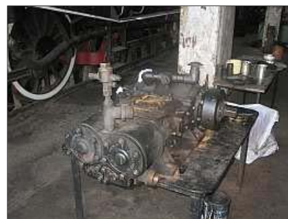
S09 - Stoker motor on the bench. It looked OK on the outside but ran quite poorly.

The first Bissel Truck was replaced on 18 November 2007 and refitted with the cleaned and repaired lubrication equipment as well as the repaired speedometer drive. The second Bissel truck received similar treatment, but after the removal work was done in December ; a front bogie rebuild required on the Reefsteamers class 15CA No.2056 "Dorothy", and repair work performed on Dave Shepherd's Class 15F No.3052 "Avril", Lyndie Lou's trailing Bissel wasn't re-assembled and installed until May 2008. It too, ended up being fitted with a full new set of bearings.