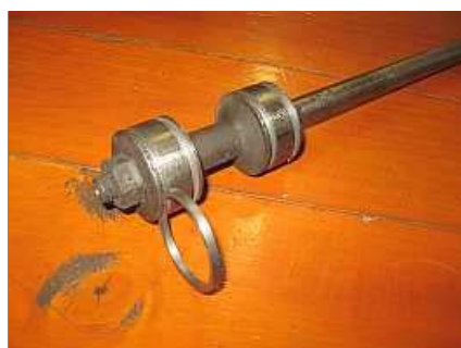
S10 - A test fit of a newly fabricated valve ring, still warm from the lathe, into the grooves of a cleaned valve spool.

However, she wasn't completely alone as she dozed in the No.4 road of the workshop - as one of our ex-railway fitters kept the big girl company for several months. The stoker motor had been removed and was completely dismantled to investigate the poor starting and low torque as reported by the transfer crew who ran the engine from Capital Park to Reefsteamers. The stoker's engine was found to have worn big end bearings, worn piston rings and one valve ring out of the original 8 remaining! The glands all leaked and the crankshaft main bearings were clapped. It's a miracle that the two-cylinder stoker engine ran at all.