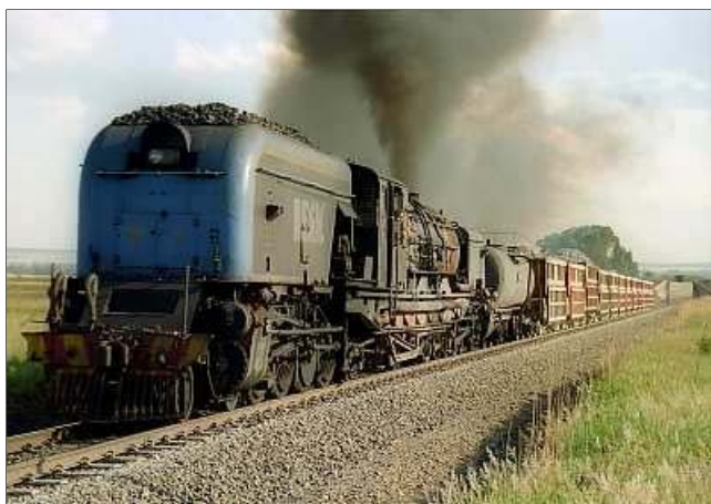
G03 - Lyndie Lou in her late gold mining days (Then running as Wendy) after her accident in 1992, subsequent repair and renumbering to R1. Here is the already scruffy engine running on the Cooke Shaft 2 line and hauling unrefined gold reef.

The locomotive "R15", was later renamed "Wendy" and would carry that name until she left the dusty mine tailings behind. It was a fatal accident on the Doornkop branch that ran out the shaft for "Lyndie Lou's" mining career. The engine was primarily rebuilt and renamed "R1". The accident occurred in 1992 which was the year that steam officially ended on the national carrier (By then reorganized as Spoornet, subsidiary of Transnet) The engine never saw much use after that and went into storage after two years. Although she basically remained intact she began to lose parts and to decay in the storage lines.