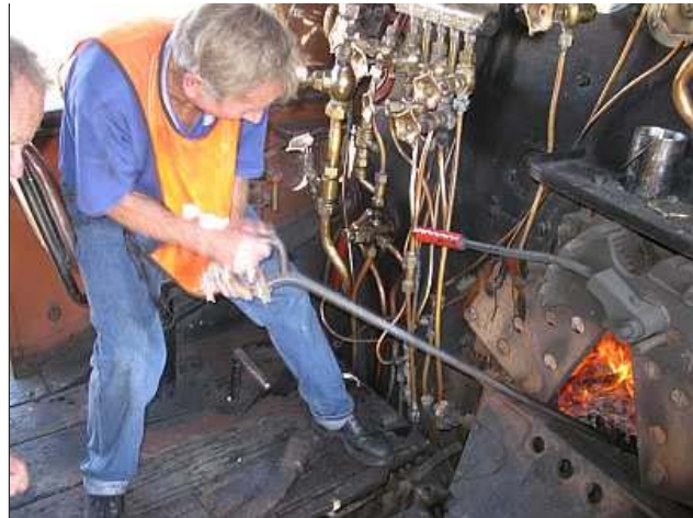
i03 - Bashing clinkers in the cab, the cotton waste well padded and the mash cooling down on the flame plate, Ex-SAR No.4079's story continues in a whole new book.

Where did the engine originally run and for what service was she originally designed? There's a story built into in every wheel arrangement, the axle loading, valve gear type, piston diameter, boiler type and size. Was she a high stepper, sprinting confidently through the Karoo, or a branch line engine winding through the country side, or perhaps meandering along the coast? Did she ply the reverses of Barkly East, or did she ever mount the summit of the Outeniqua Mountain range? Was the engine set to work in the shadow of the Drakensberg, struggle up the plateau to the highveld, or bark out a challenge amongst quad-rails threading between the sky scrapers of South Africa's growing cities? Did the engine run general loads - or seasonal traffic, perhaps the smell of crisp, fresh Cape apples mingling with the smoke, the sap of newly harvested timber from the Natal forests, the dash to meet the graceful mail ships docked at port? Did the engine slog ahead of rumbling bulk loads of coal, ore, mine props, motor cars, diesel fuel, sugar, cement and steel? Was she primarily a passenger engine, with trains of classic clerestoried coaches gradually giving way to those comprising of steel bodied elliptical roofed stock? Did the locomotive eventually go into industrial service, toiling amongst the mine dumps, the foundries and slag heaps, or was it demoted to do trip working under the wires - eventually to have the fires dropped for the last time and to be shunted into the deadlines?