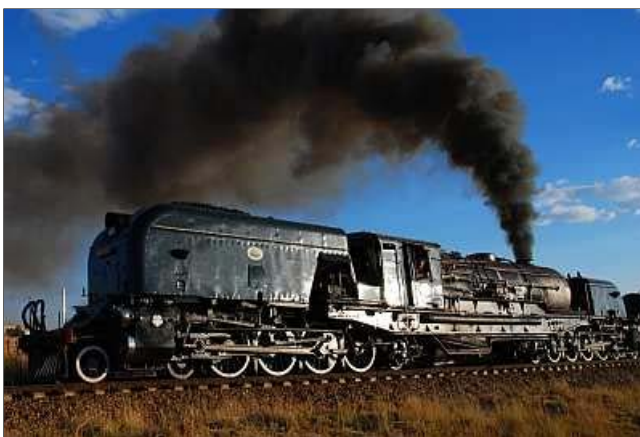
S17 - Wow! A side view for a change! Here's our girl strutting her ample stuff homeward bound (Bunker first) on her debut 550 ton haul to Magaliesburg.

But they had the engine ready to run by 5:30am the next morning, black of eyes, black of hands and a bit short of both sleep and temper! In spite of the worklamp-lit midnight drama, Lyndie Lou's first trip to Magaliesburg under the SIA banner, was a great success and the day of 31 May 2008, must go down in her story.