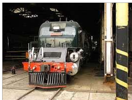
S13 - This articulated machine barely fits into our workshop tracks! Lyndie Lou's rear end is resplendent in new makeup - polished valve chest and cylinder caps and freshly painted wheels and buffer ends.

Other work including the DE-painting of Lyndie Lou's brass work and copper piping, which had been painted black to save on labour. Not a glamorous engineering project - but a tedious, long labour of love. Four of the valve chamber inspection plugs had to be removed and replaced as they weren't securely threaded - which required reshaping and thread cutting of the bosses from whence they came. A broken axle spring that was discovered during the Bissel Truck work was also replaced with much grunting and crowbar work.