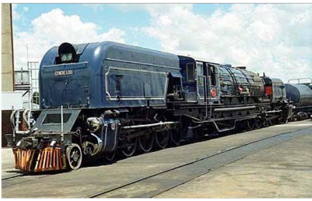
L03 - Ex-R1 Lyndie Lou as restored at REGM in 1998. She had been renamed at this point but not yet lettered. Note the characteristic REGM scare-striped cow catchers - soon painted to a more elegant, traditional black with red toe board.