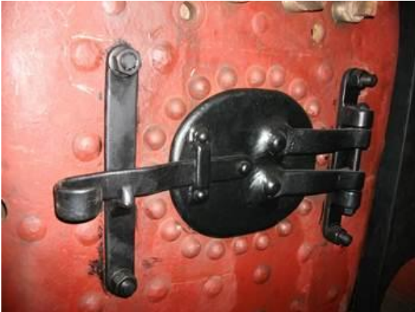
The fire box door however is now complete.

To provide some perspective as to how quickly things can come together when the components are ready to be assembled this picture of the boiler was taken on 30 th August this year.