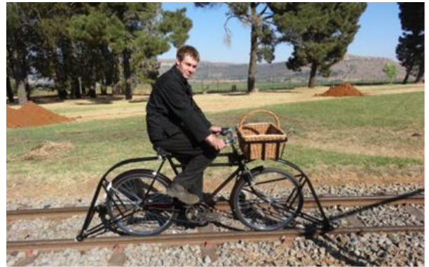
Bring your cycling shorts to Stars 2014!