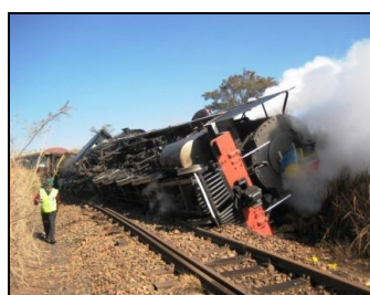
No 3117 derailed in 2010