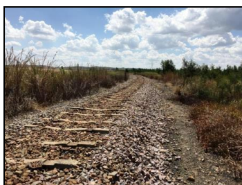
The rail-less trackbed

A copy-cat derailment took place on the Cullinan line on 21 st March after thieves stole a quarter mile section of rail, causing NBL 15F No 3052 to leave the track. Luckily, on this occasion the loco remained upright although all wheels on the engine and the first four wheels of the tender ended up in the ballast. Amazingly the line had only been inspected the day before so the theft must have occurred during the night before the trip. Regular readers will remember that back in June 2010 a similar incident befell NBL 15F No 3117 but on that occasion the loco overturned. Fortunately, no one was injured in this latest incident and No 3052 was subsequently recovered for repairs. The passengers continued safely on their journey by coach.